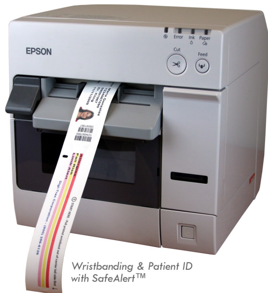
Wristbanding & Patient ID with SafeAlert™