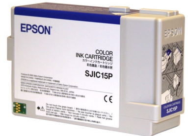
A single ink cartridge can print thousands of labels!

We are proud to be an authorized dealer and supplier of Epson products and are excited to announce the new SecureColor™ printer