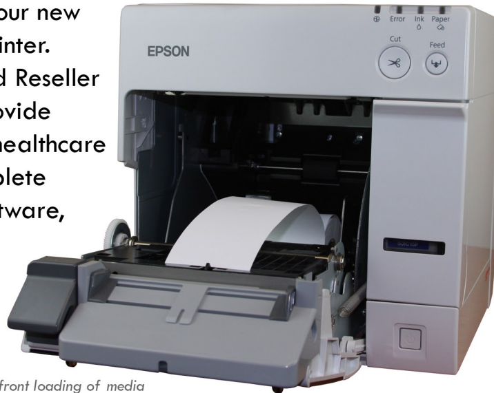
Easy, front loading of media

We have the solution with our new EPSON® SecureColor™ printer. Digi-Trax is a Value Added Reseller with a primary focus to provide innovative solutions to the healthcare community. We are a complete resource for hardware, software, supplies, validation and service for Rx and more.