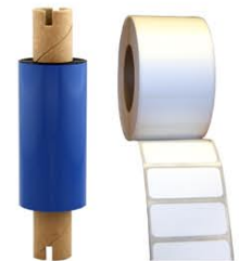
Ribbon & DIN Label Media