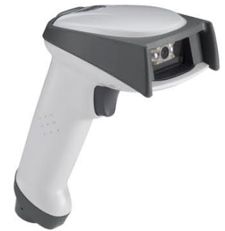
Honeywell 4600g Scanner

Reliable and time tested, Digi-Trax® label supplies have been used by hundreds of blood centers for over 20 years. These carefully matched supplies provide maximum durability, meeting the rigorous requirements found in blood banking, cellular therapy and tissue banking. Digi-Trax labels stick and remain legible when exposed to freezing, waterbath, repeated abrasion and disinfecting. Our adhesives meet CFR 21, Sec. 175.105 and have been tested for bag leaching.