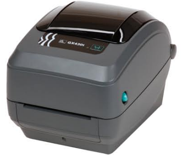
Zebra GX430t Thermal Transfer Printer

RepliTrax-DIN System is comprised of a 300 dpi Zebra G-Series desktop thermal transfer printer with Digi-Trax DIN firmware installed, a Honeywell scanner, and cables to connect to the printer. No computer is required. The firmware is designed to replicate and print compliant ISBT-128 DIN bar code labels for blood bags (medium density) and test tubes (high density). RepliTrax-DIN combines the “best-of-class” scanning & print technology with reliable Digi-Trax embedded firmware.