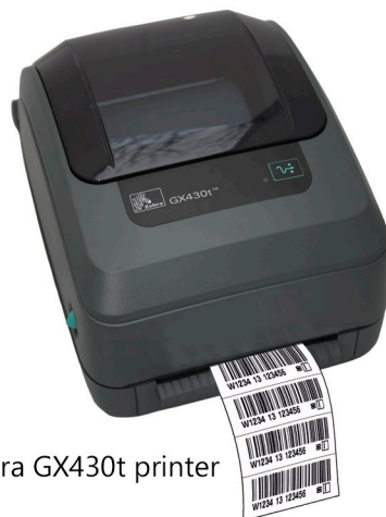
Zebra GX430t printer

The software contains reporting features that will satisfy all regulatory requirements. There is no need for handwritten logs – all necessary information is saved and can be generated from DINselect™-SA.