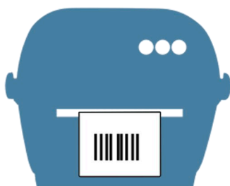
Digi-Trax® thermal printer

To “test drive” our DINselect™ software, contact Digi-Trax® at 800-356-6126 or at info@dig-trax.com