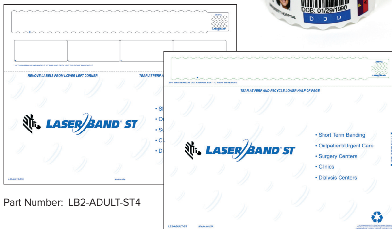
Part Number: LB2-ADULT-ST4

Specifications subject to change without notice.