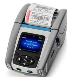
ZQ610-HC ZQ61-HUWA000-00 (WiFi Model)