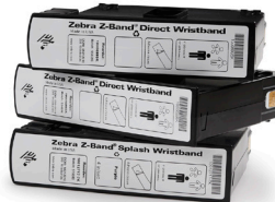
Z-Band Wristband Cartridges for ZD510-HC 10015355K (White), 10015355-2K (Blue), 10015355-3K (Green), 10015355-5K (Pink)