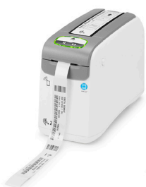
ZD510-HC ZD51013-D01E00FZ (Ethernet Model) ZD51013-D01B01FZ (WiFi Model)

Enable quick identification of special patient conditions with color-coded wristbands from Zebra. Available by cartridge for ZD510-HC, or rolls which are compatible with standard desktop printers.