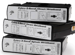
Z-Band Wristband Cartridges for ZD510-HC 10015355K (White), 10015355-2K (Blue), 10015355-3K (Green), 10015355-5K (Pink)