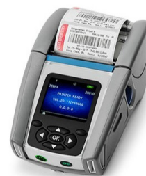
ZQ610-HC ZQ61-HUWA000-00 (WiFi Model)