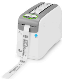
ZD510-HC ZD51013-D01E00FZ (Ethernet Model) ZD51013-D01B01FZ (WiFi Model)

Enable quick identification of special patient conditions with color-coded wristbands from Zebra. Available by cartridge for ZD510-HC, or rolls which are compatible with standard desktop printers.