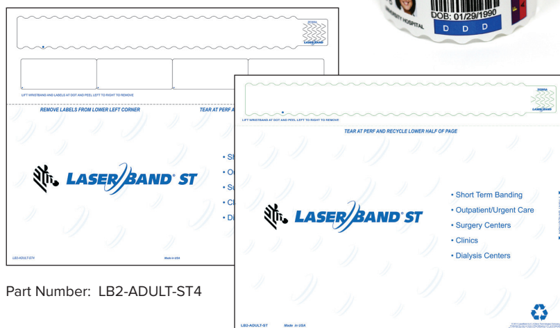
Part Number: LB2-ADULT-ST4

Specifications subject to change without notice.