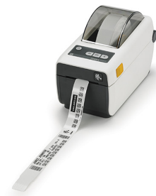
ZD410-HC ZD41H22-D01E00EZ (Ethernet, USB, BTLE) ZD41H22-D01W01EZ (USB, 802.11ac, Bluetooth 4.0)