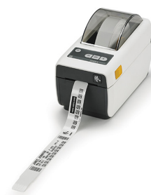
ZD410-HC ZD41H22-D01E00EZ (Ethernet, USB, BTLE) ZD41H22-D01W01EZ (USB, 802.11ac, Bluetooth 4.0)