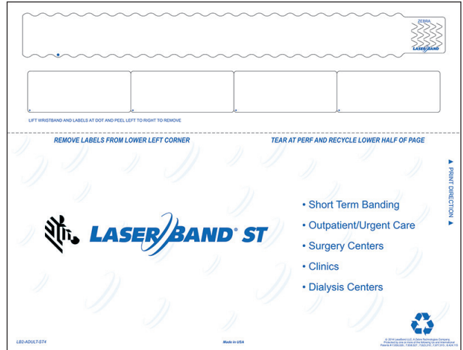
Part Number: LB2-ADULT-ST4

Specifications subject to change without notice.